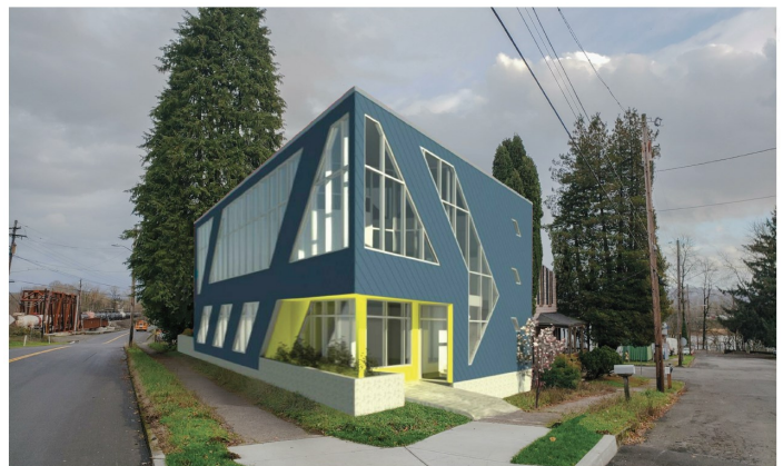
Lacamas View Residential Care Facility

You are invited to offer comments regarding important design issues, which you believe, should be addressed in the decision for these projects. Procedures for a public meeting will be followed in accordance with RCW 42.30, which differs from a public hearing. Comments may be submitted by regular mail to the Planning Division, City of Camas, 616 Northeast Fourth Avenue, Camas, WA 98607; or by email to: communitydevelopment@cityofcamas.us .