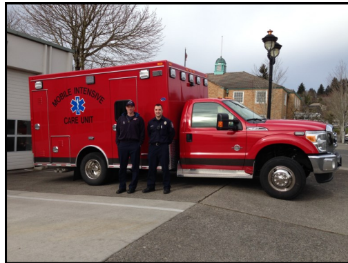
Paramedics Michael Coyle and Eric Bridges with CWFD's new 4x4 Braun Ambulance

The start of 2014 has been very busy for CWFD. Very harsh winter weather returned to East Clark County at the start of February. Wind chills temperatures were at 0, while blizzard conditions brought travel to a standstill. Fortunately CWFD had recently taken delivery of our first 4x4 ambulance (pictured above), which greatly increased the department's ability to respond to the needs of our citizens. The final wrap up of the fire department merger process continued in earnest during January and February. The transition team met in early January to plan out the