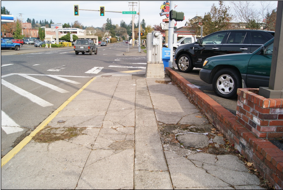
Figure 2: Example of damaged sidewalk that is a barrier to the disabled