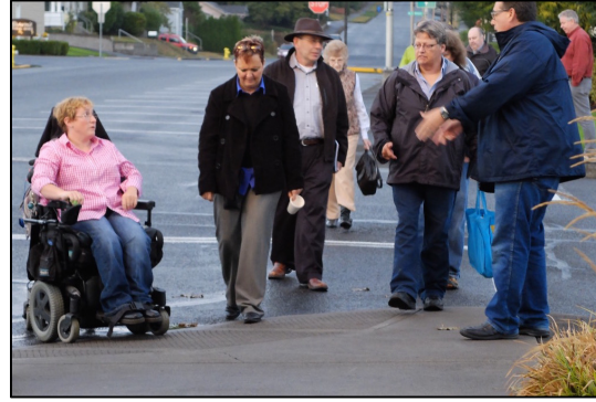
Figure 5: CAC members at work, in meeting and in field accessibility tour