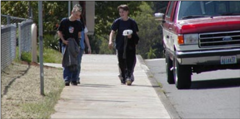
Figure 5: Example of children walking to school on funded sidewalk

The Safe Routes to School Program or the TAP Program are great funding sources for upgrades to high priority locations that include sidewalk in-fill in the vicinity of schools or other pedestrian destinations. Safety and accessibility improvements made to pedestrian facilities closest to schools can allow more students to walk to school and assist school districts in providing transportation to more distant students, as these state funds become more limited each year.