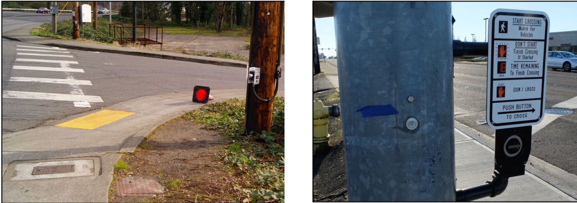
Figure 3: Examples of pedestrian push buttons, inaccessible versus accessible