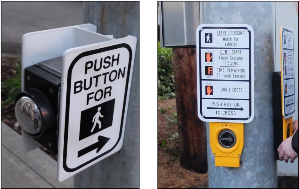
Figure 4: Examples of pedestrian push buttons, existing (left) and APS (right)

The Washington State City Safety Program has been used effectively in Pasco (Court Street) and in Vancouver (Fourth Plain Boulevard) to make ADA upgrades at high priority locations within larger corridor “safety” projects. Signal upgrades often rank among the highest of any improvement for safety grants. This is an excellent opportunity to make intersections built before 2010 ADA compliant by upgrading the same traffic signals with Accessible Pedestrian Signal (APS) hardware. The key strategy is to propose ADA enhancements on locations with serious or fatal injury traffic collisions.