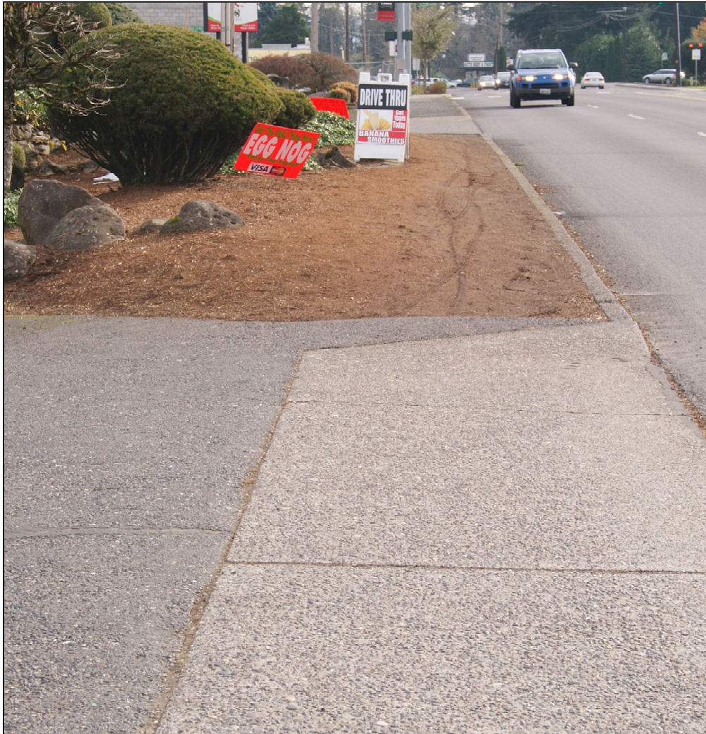
Figure 6: Examples of existing missing sidewalk section