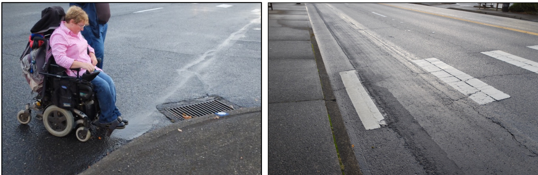
Figure 6: Examples of levels of accessibility experienced during the CAC field tour, such as a missing ramp and a ramp with an outdated design

See Appendix C for more information on the CAC and materials from meetings.