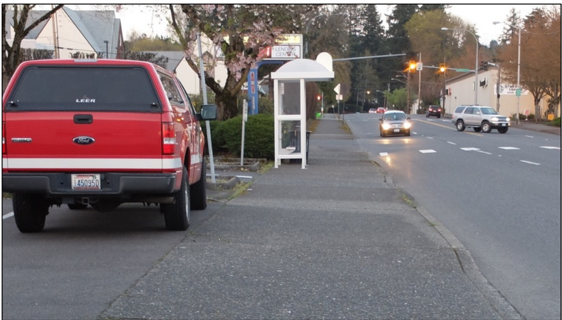
Figure 6: Example of an improved bus stop

C-TRAN has a Streamlining Project program that systematically retrofits existing fixed route transit stops with ADA accessible concrete pads and other enhancements. This grant program has not been used for any bus stop enhancement work in Camas yet. Although no funding appears available until the 2016 grant cycle, this source looks like a very good opportunity to fund bus stop upgrades along the Route 92 corridor.