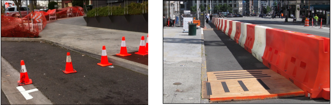
Figure 4: Examples of work zone accessibility, inaccessible versus accessible