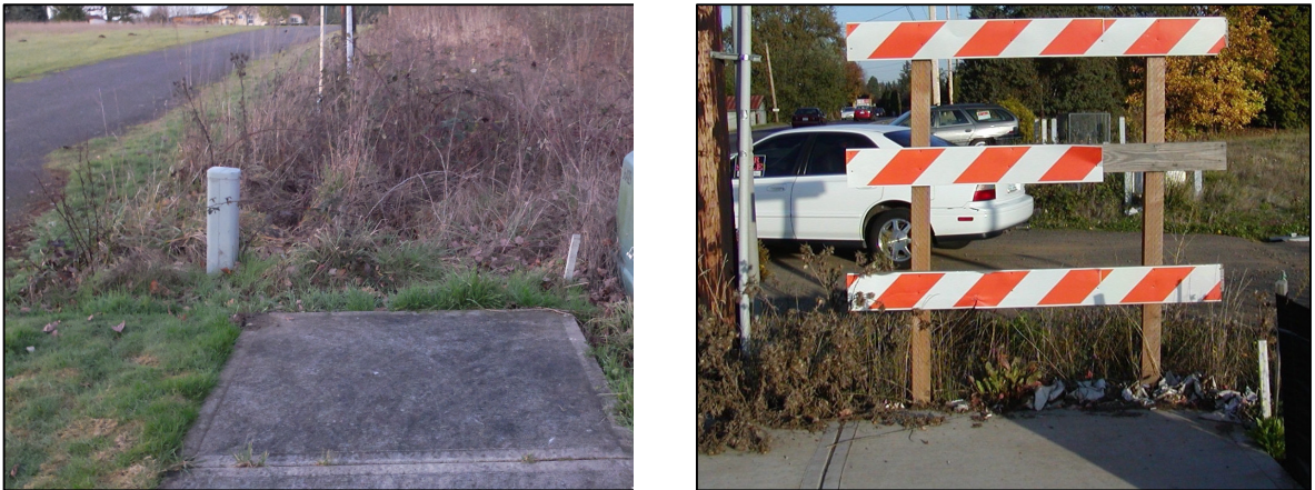
Figure 2: Examples of accessibility barriers in a developing pedestrian network

There are additional design issues and decisions that can be addressed, such as retrofitting urban streets often requires maneuvering around utility poles, adding ramps when sidewalk gaps are located midblock, and other obstructions, as well as complications not covered in the Camas Design Standards Manual. Many self-evaluations find that these physical gaps often occur at the edge of new developments or during half street improvements when one side of the road is compliant but not the other. This can be accomplished by supplementing the current street details with the current standards, such as the WSDOT Design Manual or the WSDOT Field Guide for Accessible Public Right of Way, 2012 Edition. Citizen committees will find the latter document is more user friendly.