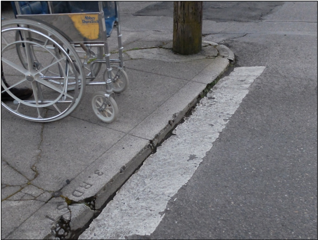
Figure 3: Example of full height curb that is a barrier to the disabled

The Community Development Block Grant (aka CDBG) program can provide funding at prioritized locations but will be limited to funding upgrades to new curb ramps at intersections without existing ramps. This is important because full height curbs are true barriers in the public right of way. The inventory of high priority locations found that most Camas intersections have ramps but a few projects as proposed are expected to be stand-alone CDBG projects due to the current funding guidance restrictions.