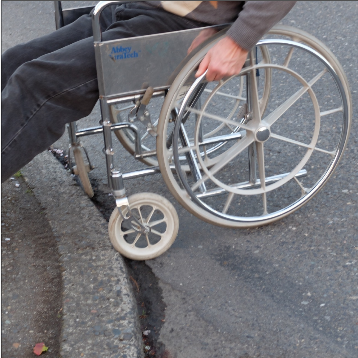
Figure 1: Example of ramp lip of gutter that is a barrier to the disabled

As property is redeveloped, the City will have the opportunity to require ADA upgrades to the sidewalk system. This provides another local funding source to reach the vision set forth in this plan.